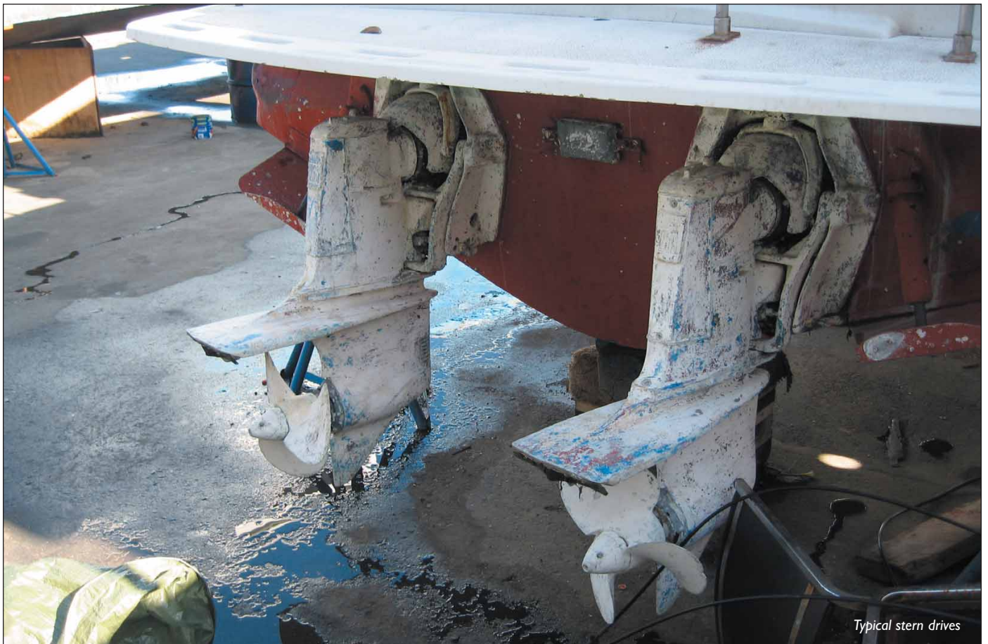
Typical stern drives

My first thought on replacing the Volvo stern drive was rather straight forward: just get a bigger one. The Konrad stern drive is substantially larger and stronger than Mercury or Volvo stern drives and can handle a much higher horsepower engine. But after viewing one I decided it looked pretty much the same as the stern drive I had, only much larger. Any increase in speed