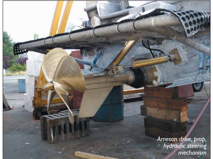
Arneson drive, prop, hydraulic steering mechanism

A traditional fixed surface drive is a shaft exiting the transom