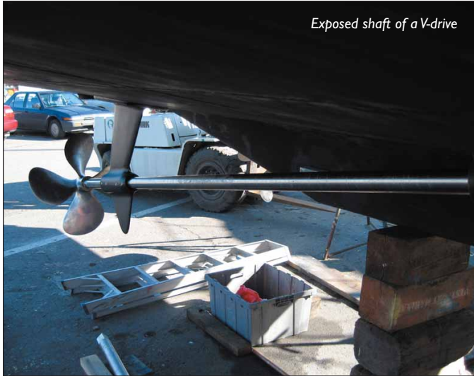
Exposed shaft of a V-drive

from a more powerful engine would be cancelled out by the increase in drag due to the size of the drive leg. I imagined having all the same troubles, but on a larger scale, so I deleted a bigger stern drive from the list of options.