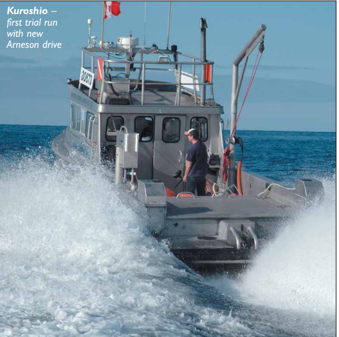
Kuroshio – first trial run with new Arneson drive